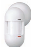
ATP1600W, ATP120HB Series

Note: All wall mount sensors must use a CU series control units. See below for details.