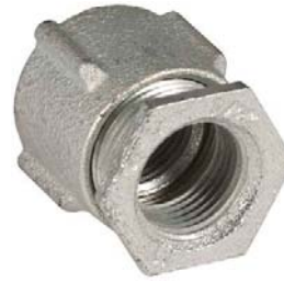
Three-piece Couplings Malleable

A = Overall length B = O.D. body C = I.D. body D = Thread size