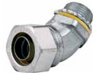
45° Angle with Male Hubbell Conduit Fitting H0504

Note: See page T-116 for additional technical data.