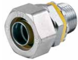
Straight with Male Hubbell Conduit Fitting H050

Note: See page T-116 for additional technical data.