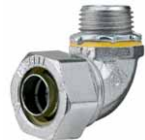
90° Angle with Male Hubbell Conduit Fitting H0509

Notes: 3/8" Liquidtight conduit fitting have 1/2 N.P.T. male threads. For use with Liquidtight Metal conduit and PolyTuff I Non-Metallic conduit. See page T-116 for additional technical data.