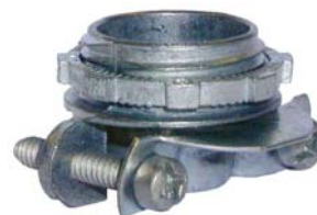
Connectors For Oval or Round Cable Die Cast Zinc