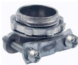
Connectors For Oval Cable Die Cast Zinc