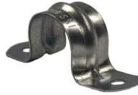
Two Hole Straps Stamped Steel