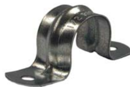
TWO HOLE STRAPS STAMPED STEEL