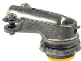
90 Degree Squeeze Insulated Throat Malleable Iron