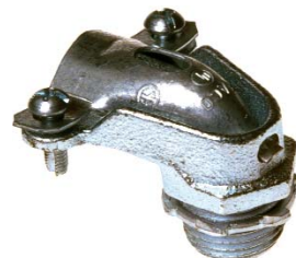
90 Degree Squeeze Uninsulated Throat Malleable Iron