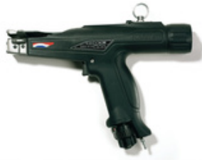
MK9P 110-09100 Pneumatic Tensioning Tool Plastic Housing