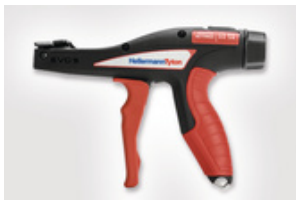
EVO9 110-80002 Manual Tensioning Tool Plastic Housing