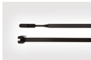
Q18R 109-00059 Cable Ties with open head