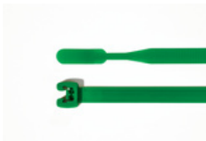
Q18R 109-00148 Cable Ties with open head