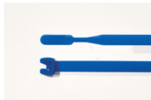
Q18R 109-00147 Cable Ties with open head