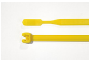
Q18R 109-00150 Cable Ties with open head