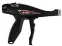
EVO7SP 110-70130 Manual Tensioning Tool Plastic Housing