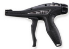
EVO7 110-70129 Manual Tensioning Tool with Plastic Housing