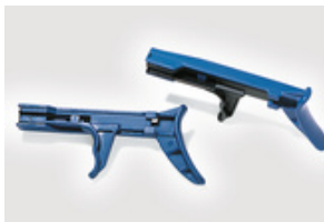
MK21 110-21016 Manual Tensioning Tool for Cable Ties, simple version