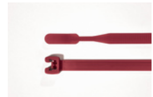
Q18R 109-00149 Cable Ties with open head