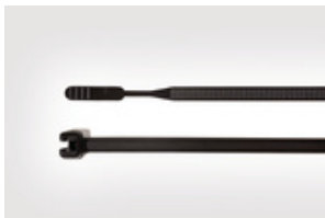
Q18R 109-00030 Cable Ties with open head