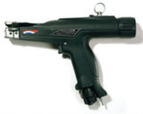
MK9P 110-09110 Pneumatic Tensioning Tool Plastic Housing