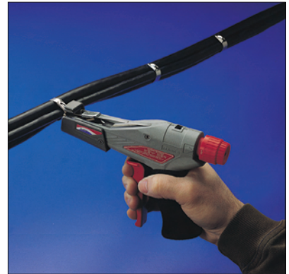
HellermannTyton's MK9SST tool is durable and lightweight, offering superior stainless steel cable tie installation.