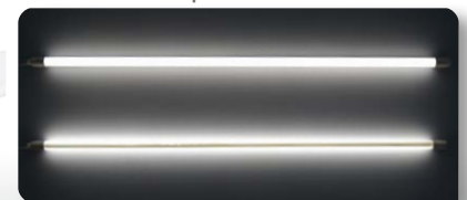
Lamp Back View