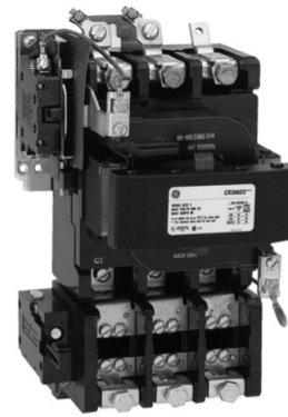
Typical CR306 Size 4 magnetic motor starter

GE's magnetic motor starters listed here may be used for starting full-voltage, nonreversing, single-speed ac motors up to 1600 horsepower, 600 Volts maximum, providing protection to the motor against running or stalled overloads. Their compact size and ease of wiring make them especially suitable for motor control centers, custom-type control panels, and switchgear equipment. Refer to page 1-9 for features of basic starter.