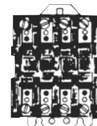
Molded Stationary Contact Support