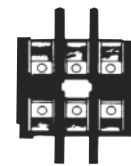
Cover for Movable Contacts