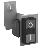
Start/Stop Push Button