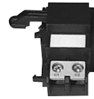
Remote Electrical Reset