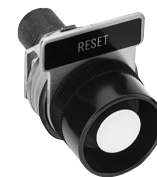
Reset Kit for Starter Enclosure