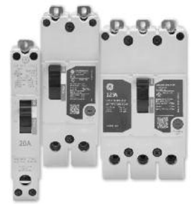
TEYD, TEYH, TEYL