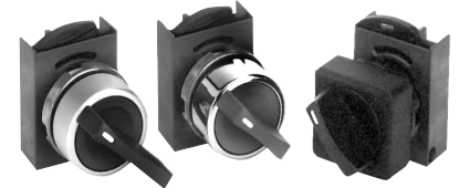
4-Position Selector Switches