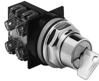
Key Selector Switch

Key Operated Non-Illuminated 600 Volts Max. AC/DC 10 Amperes Continuous