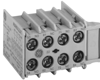
4-Pole Front-Mounted Auxiliary Contact Block MARN4/MACN4