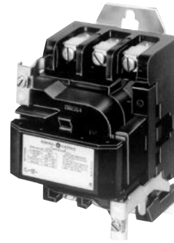
Open 60-Amp Electrically Held Lighting Contactor