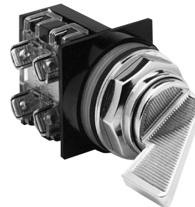
Lever-Operated Selector Switch

Lever Operated Non-Illuminated 600 Volts Max. AC/DC 10 Amperes Continuous