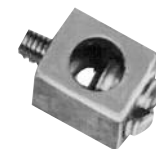
Load Lug THQEL3