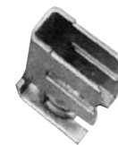
Quick Connector THQECC