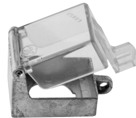
Padlocking Device with Clear Cover