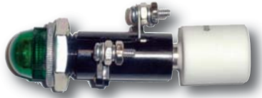
ET-16 indicating lamp

The ET-16 (Incandescent) and ET-17 (Neon) indicating lamps are designed for application on switch-board panels up to and including 0.25 inch thickness. The lamps economize on space and permit easy replacement of bulb and resistor.