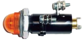
ET-17 indicating lamp