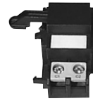
Remote Electrical Reset