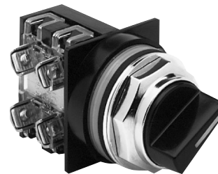
Knob-Operated Selector Switch

Knob Operated Non-Illuminated 600 Volts Max. AC/DC 10 Amperes Continuous