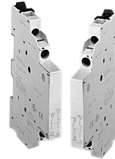
GPAC__LLA/GPAC__LRA Side Mounted Auxiliary Contacts