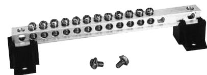
TGK12 with TGKIS