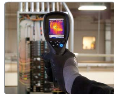
Find Hot Spots Fast!