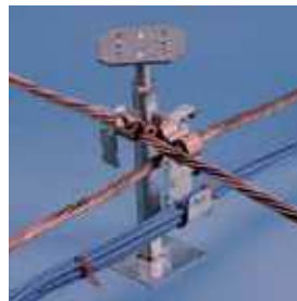
MBNUPCJ240 + CAT32HP (2" J-Hook)