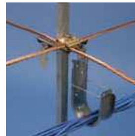
MBNUPCJ82 + CAT48HP (3" J-Hook)