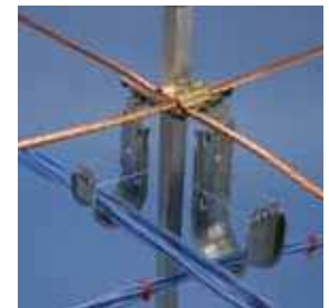
MBNUPCJ82 + CAT32HP (2" J-Hook) + CAT48HP (3" J-Hook)