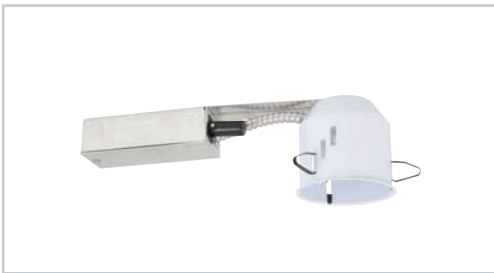
DESIGNED FOR 2" X 4" JOIST CONSTRUCTION (3-5/8" IN HEIGHT)