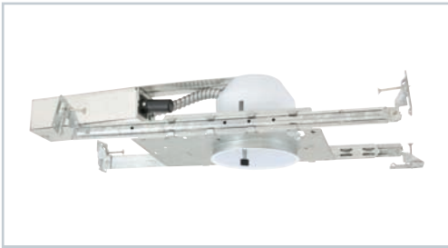
DESIGNED FOR 2" X 4" JOIST CONSTRUCTION (3-5/8" IN HEIGHT)