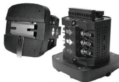
IQ 100T Transducer Only