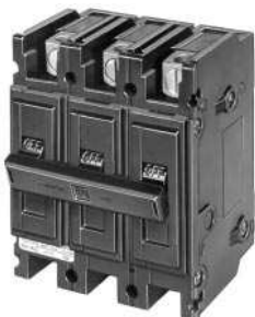
QUICKLAG Type QC 3-Pole