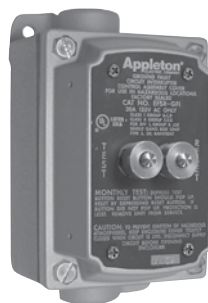
EFSR-GFI cover mounted on single-gang EFD box. The GFI cover has separate factory sealed sealing chamber and is suitable for Class I, Group B as well as Class I, Groups C and D; Class II, Groups E, F, G and Class III.