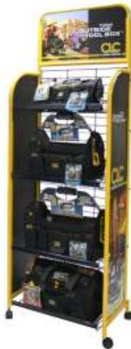
Single Sided Tech Gear™ Merchandising Mix - Stereo Speakers and LED Lights -

> Here are just three examples of Merchandising Display Opportunities to Display and Dispense these High Quality and Innovative Products > See Your LH Dottie Account Manager for Standard and Custom Product Mixes