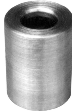
Counter Flashing for Vent Pipe

Suggested Specification Statement: Provide FlashCo L-Series lead flashing with counter flashing for each round roof penetration. Include stainless steel hose clamp and appropriate caulking sealant for each non-vent penetration. Flashing shall be installed in accordance with the recommendations and specifications of the roofing material manufacturer.