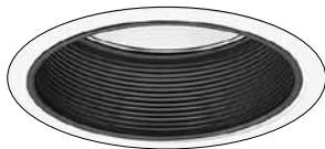
RMA101 (Shown) Clear Black Baffled Reflector RMA101W Clear White Baffled Reflector