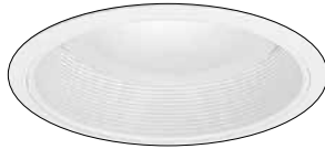
RM40W (Shown) White Stepped Baffle RM40 Black Stepped Baffle