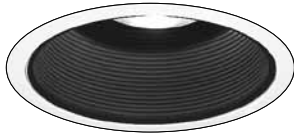
RM30 (Shown) Black Stepped Baffle RM30W White Stepped Baffle RMC30W White Stepped Baffle (48 PK Only)

Compatible housings and maximum wattages listed