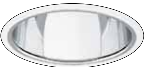
RMA100CLR (Shown) Clear Specular Reflector RMA100BLK Black Reflector