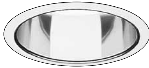
RMS30CLR (Shown) Clear Reflector RMS30GLD Gold Reflector RMS30BLK Black Reflector RMS30WHT White Reflector