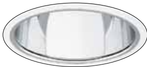
RBA100BLK Black Cone RBA100CLR Clear Cone RBA100WHT White Cone RBA100TBZ* Tuscan Bronze Cone RBA100CBN* Coffee Bean Cone RBA100SPM* Soft Platinum Cone RBA100RCP* Rustic Copper Cone RBA100MCA* Mocha Cone

*Flange matches trim finish Socket Supporting 7-3/8" O.D. (187 mm)