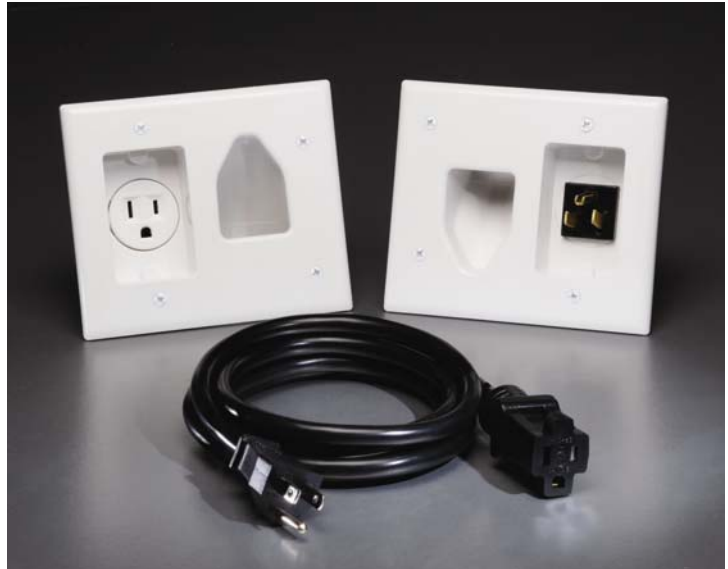
45-0021-WH Plate, 45-0023-WH Plate & 6 Ft. Straight Blade Extension Cord

Using the local electrical code approved installation, pull an approved 14/2 with ground or 12/2 with ground building wire cable from the installed Recessed Low Voltage Cable Plate with Power to the selected site in the equipment room. Install a new or old workbox before installing the Recessed Pro-Power Cable Plate with Straight Blade Inlet. This is a non-energized connection. To energize this connection, simply plug the supplied 6 ft. straight blade extension cord into the recessed straight blade inlet and plug the straight blade end of the extension cord into your rack mounted surge protector.