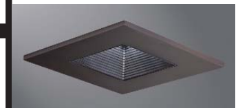
3011TBZBB Tuscan Bronze with Black Baffle