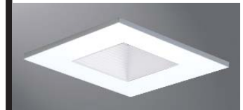
3011WHWB White with White Baffle