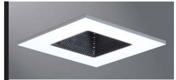
3011WHBB White with Black Baffle

Lamp Aperture: 2" [51mm] Baffle Width: 2-1/4" [57mm] Ceiling Opening (round): 3-3/4" [95mm] Outside Dimension: 4-1/4" Square [108mm]