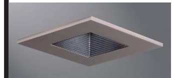
3011SNBB Satin Nickel with Black Baffle