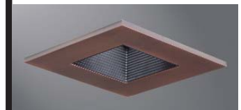
3011ACBB Antique Copper with Black Baffle