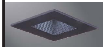
3011BKBB Black with Black Baffle