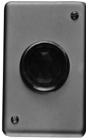
For pilot light units (furnished with jewels)