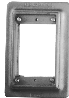
FS flush mounting adapter (can be used with multi-gang bodies having individual cover openings. Furnished with gasket and screws)