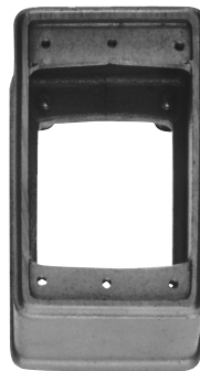
EXF Extensions (takes covers and flush rectangular wiring devices, or plug receptacles with housings)