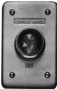
For pilot light units (furnished with jewel and gasket).