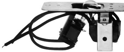
Pilot light (with transformer)†, FD only