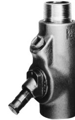
1 1/4" – 4" Male & female hub