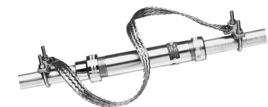
XJG shown with optional bonding jumper