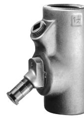
1 1/4" – 4" Female hub