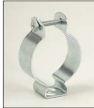
With Bolt And Nut