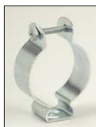
With Bolt and Nut