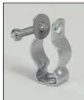
With Retained Bolt and Thread Impression