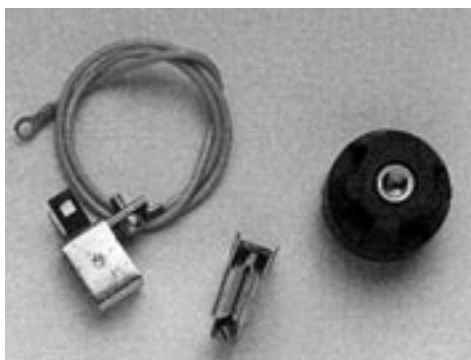
50371, 50365, 25104