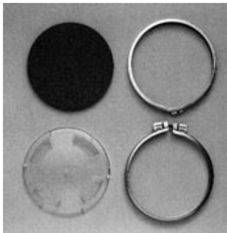
CLOCKWISE FROM TOP LEFT: 30420, 25016A, 25016D, 25162