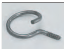
Lag Screw for Wood Beams