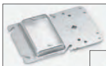
Single Gang BB40 Series