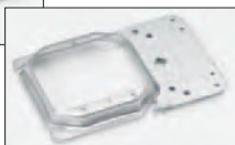
Double Gang BB45 Series