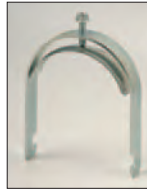
B1532S thru B1564S