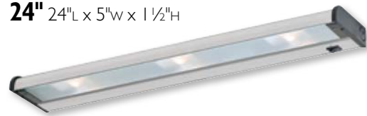
24" 24"L x 5"W x 1 1/2"H