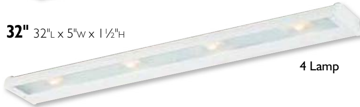
32" 32"L x 5"W x 1 1/2"H