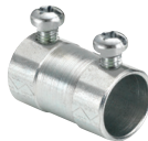
1/2" thru 2"