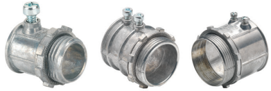
1/2" thru 1"